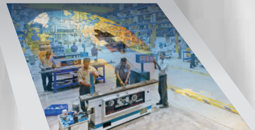
World class manufacturing infrastructure