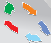
System Approach to grinding