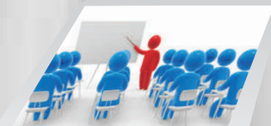
Trained & Skilled manpower