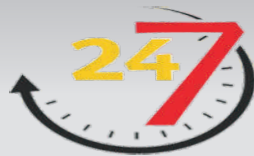
24 x 7 After Sales Service